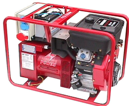
POWERI 10,0 BV-S